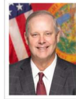
Commissioner of Ag – Wilton Simpson