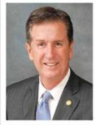
Senate President Jim Boyd