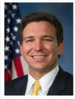
Governor – Ron DeSantis